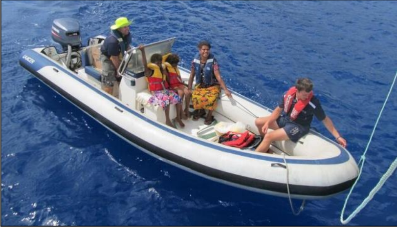
Above: Riding in the RIB was one of Isabel's favourite things to do while on the Pacific Hope. Right: On the final evening on-board ship, the crew went to great trouble to set up the dining & lounge area for a special celebration dinner.

Donations can be sent to: <u>www.marinereach.com</u> email: <u>info@marinereach.com</u>